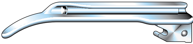
Standard Miller blade